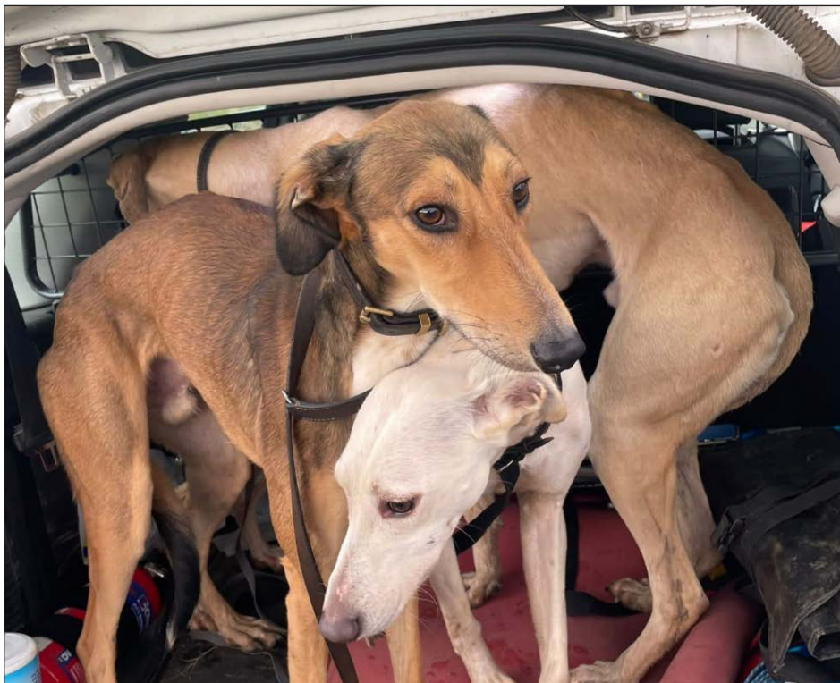
These lurchers were being used for hare coursing – and part of the offenders’ assets seized by the police.