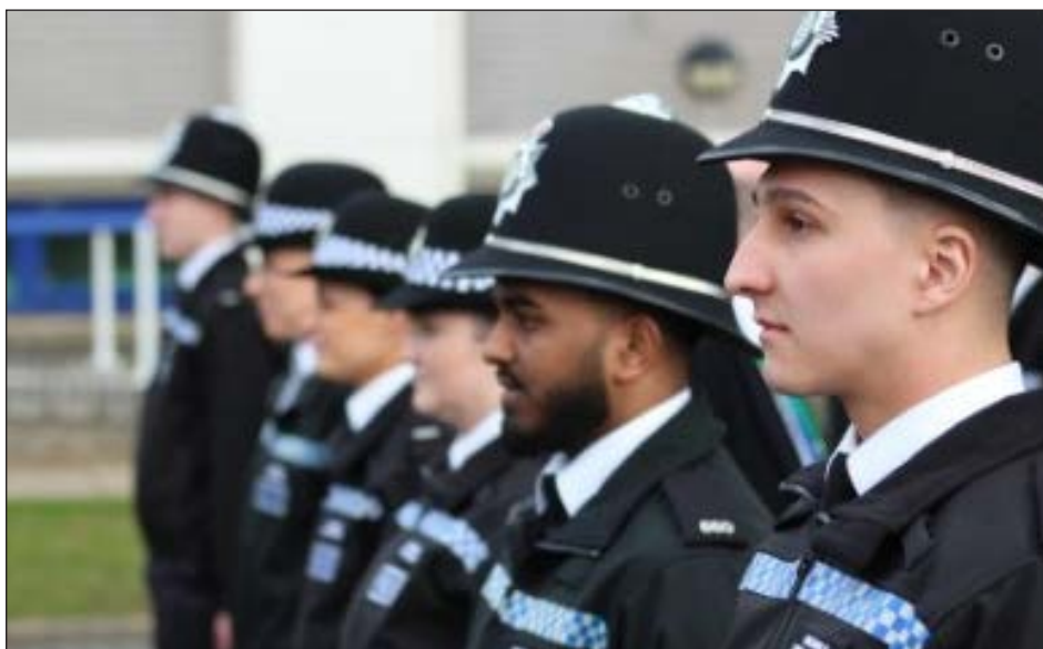
Some of the Constabulary’s new officers at a 2023 Passing Out Parade.